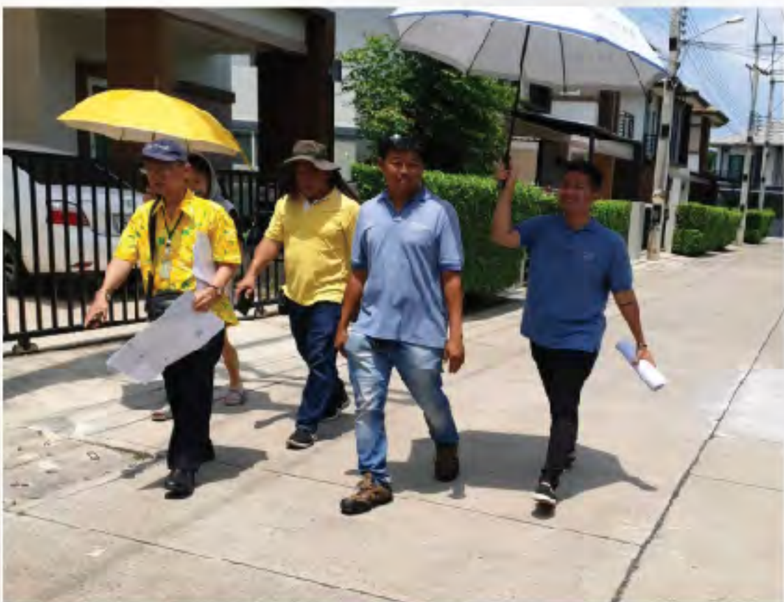
PUBLIC FACILITIES INSPECTION BEFORE THE HANDOVER, ENSURES THAT EVERY PROJECT AND CONSTRUCTION IS STANDARDIZED.