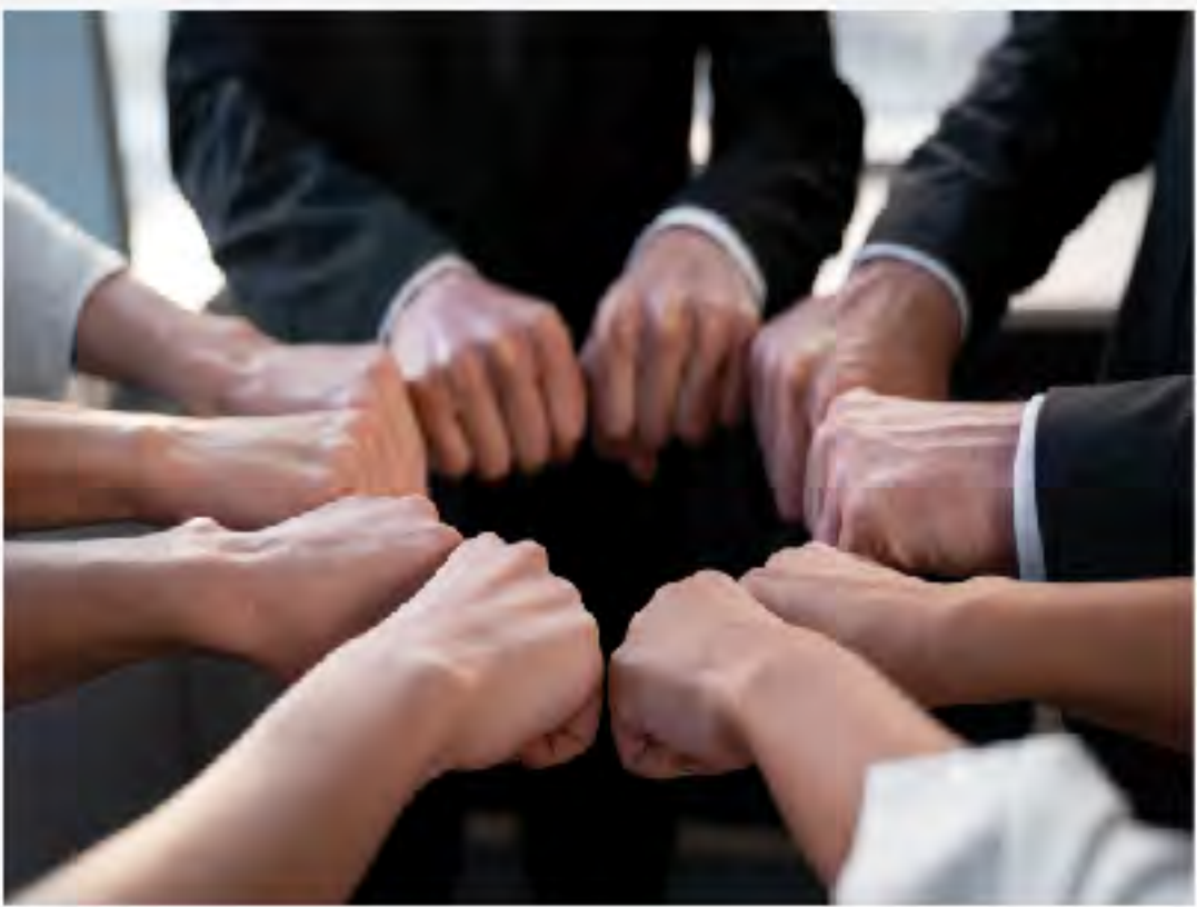
ZERO PENDING COMPLAINTS REQUIRING GOVERNMENT INTERVENTION

THROUGH PATTA'S DEDICATION TO INTEGRITY, WE HAVE FOSTERED A STRONG SENSE OF TRUST AND BUILT ROBUST CONNECTIONS WITH CUSTOMERS AND THE COMMUNITY.